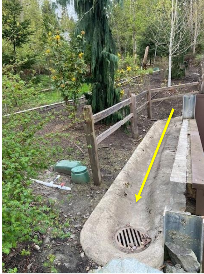
Runoff sheet flows east toward the adjacent Aegis Living property and is collected by an interceptor trench along the property line.