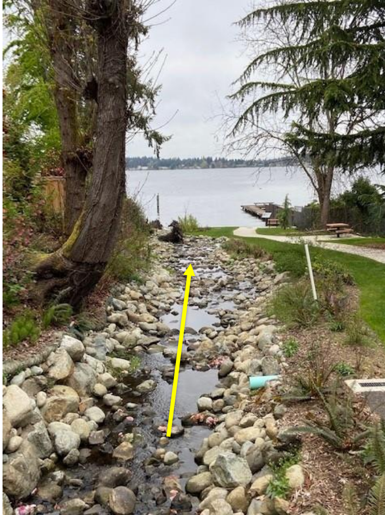
The open channel continues north through Lincoln Landing and outfalls to Lake Washington Approximately 2,400 ft from the site.