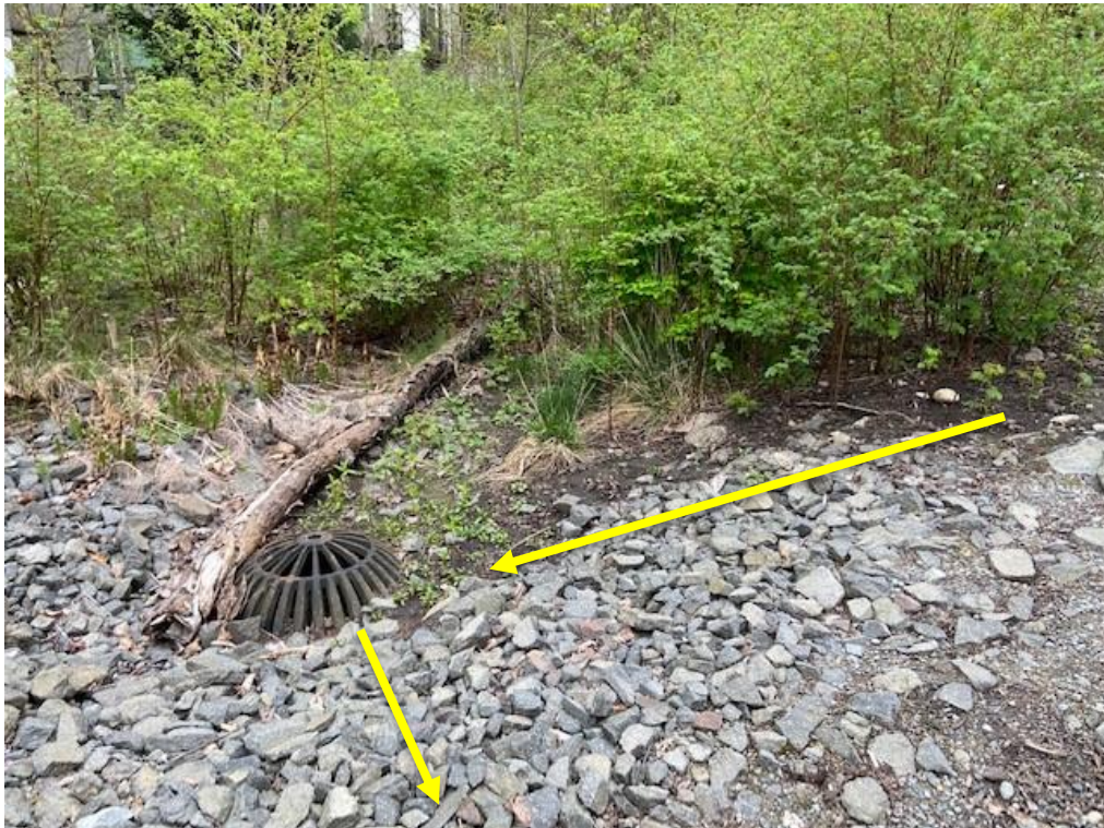
This system connects to the community flow through system, within the Aegis Living property.